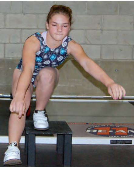
The BFS balance protocol is performed without shoes because an outside variable can affect the outcome. Shown here is an athlete performing the single-leg squat in bare feet and with weightlifting shoes; note that she can easily do a full squat with the shoes. This is followed by a high school athlete who can easily perform a full single-leg squat with tennis shoes.

this athlete's stability. That being said, consider that this matter requires much more study and investigation.