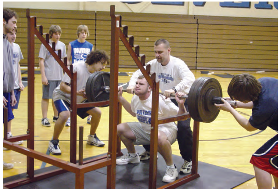
Being able to squat heavy weights will improve athletic performance, but such strength must be preceded by an appropriate level of balance and control.

The tests are performed on a flat surface in stocking feet. Shoes are removed because they can affect the results of the tests, sometimes improving the outcome and sometimes making the outcome worse. For example, a weight-lifting shoe helps align the foot with the ankle and provides a stable platform for the athlete, providing increased stability